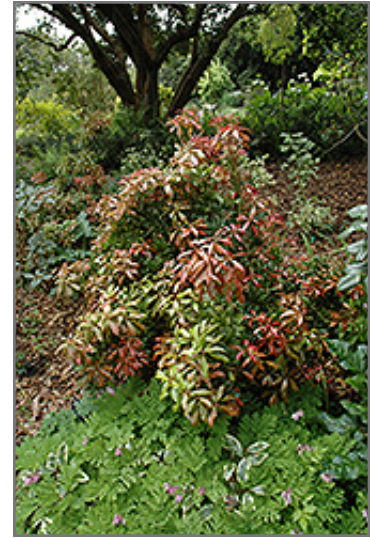
Mountain Fire Japanese Pieris

This shrub does best in full sun to partial shade. It requires an evenly moist well-drained soil for optimal growth, but will die in standing water. It is very fussy about its soil conditions and must have rich, acidic soils to ensure success, and is subject to chlorosis (yellowing) of the foliage in alkaline soils. It is somewhat tolerant of urban pollution, and will benefit from being planted in a relatively sheltered location. Consider applying a thick mulch around the root zone in winter to protect it in exposed locations or colder microclimates. This is a selected variety of a species not originally from North America, and parts of it are known to be toxic to humans and animals, so care should be exercised in planting it around children and pets.