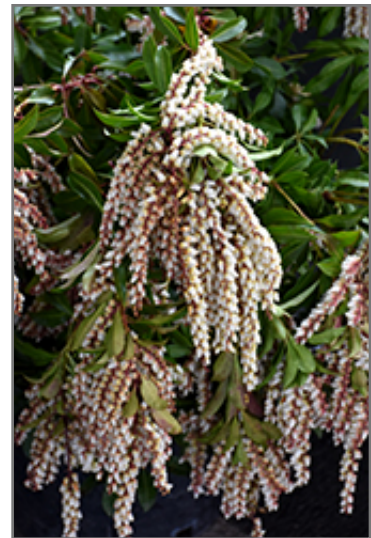
Mountain Fire Japanese Pieris flowers