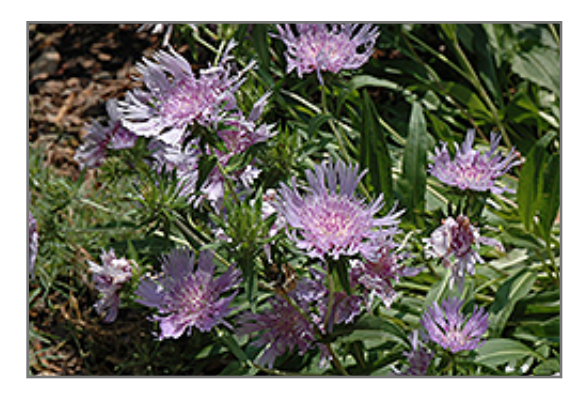
Blue Danube Aster flowers