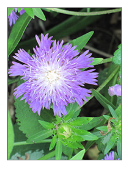
Blue Danube Aster flowers

Blue Danube Aster is recommended for the following landscape applications;