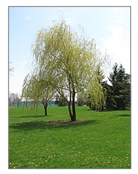
Annularis Babylon Weeping Willow in spring