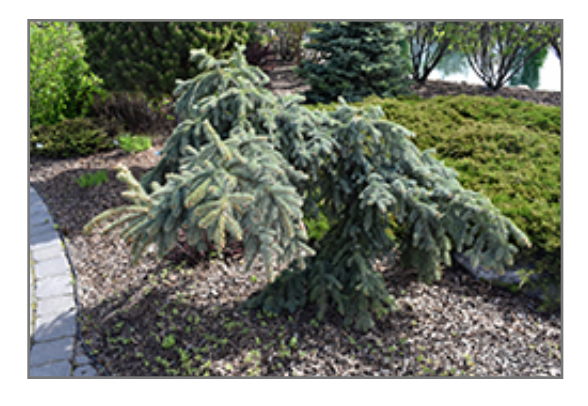
Weeping Blue Spruce