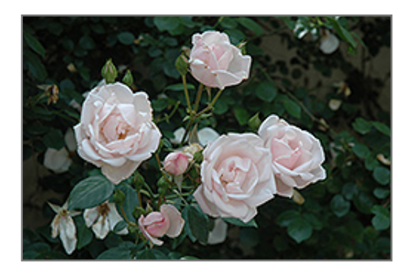
New Dawn Rose flowers

This woody vine will require occasional maintenance and upkeep, and is best pruned in late winter once the threat of extreme cold has passed. It is a good choice for attracting bees to your yard. It has no significant negative characteristics.