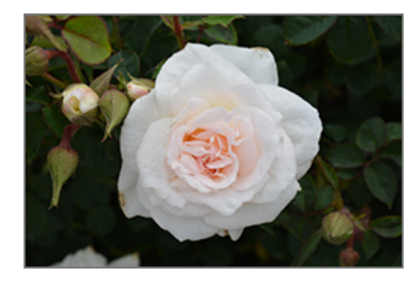
New Dawn Rose flowers

New Dawn Rose is a multi-stemmed deciduous woody vine with a twining and trailing habit of growth. Its average texture blends into the landscape, but can be balanced by one or two finer or coarser trees or shrubs for an effective composition.