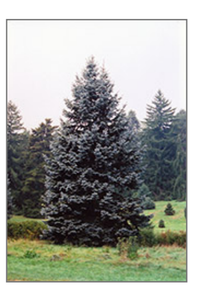
Hoopsii Blue Spruce