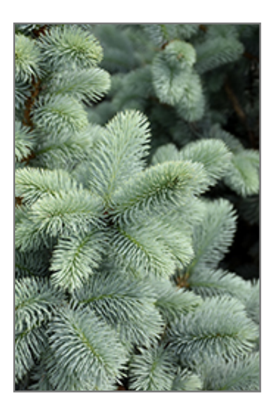
Hoopsii Blue Spruce foliage