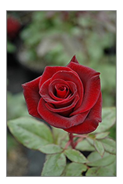
Black Magic Rose flowers