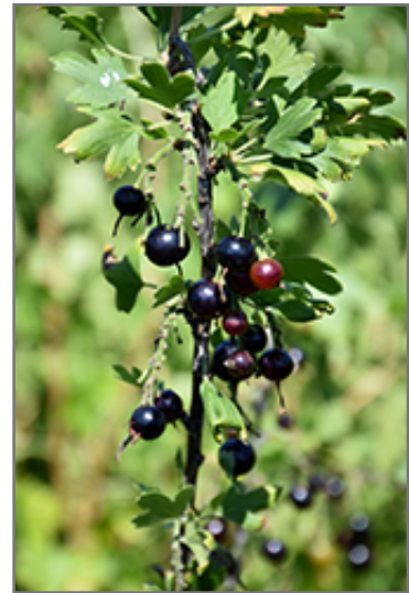
Black Currant fruit

Black Currant has rich green deciduous foliage on a plant with a round habit of growth. The lobed leaves turn yellow in fall. It features an abundance of magnificent black berries in mid summer.