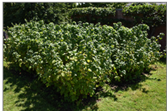
Black Currant