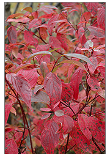
Red Osier Dogwood in fall