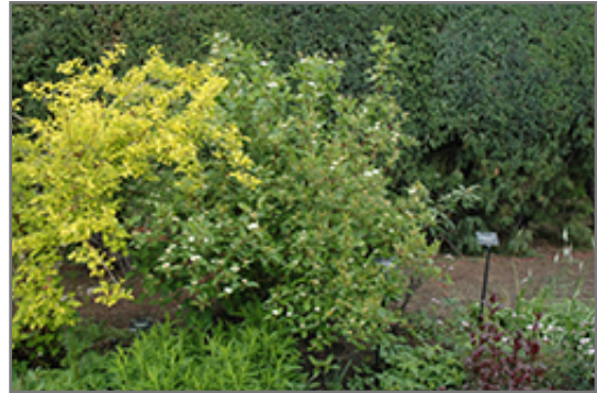
Red Osier Dogwood

This shrub does best in full sun to partial shade. It is an amazingly adaptable plant, tolerating both dry conditions and even some standing water. It is not particular as to soil type or pH. It is highly tolerant of urban pollution and will even thrive in inner city environments. This species is native to parts of North America.