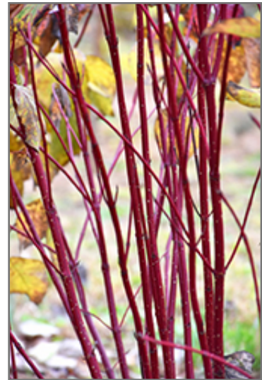
Red Osier Dogwood stems