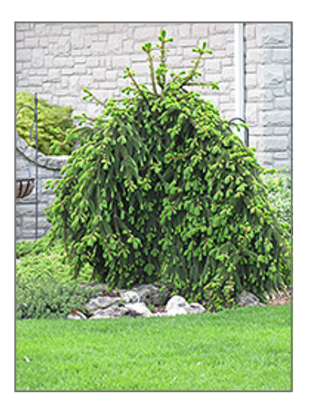
Weeping Norway Spruce