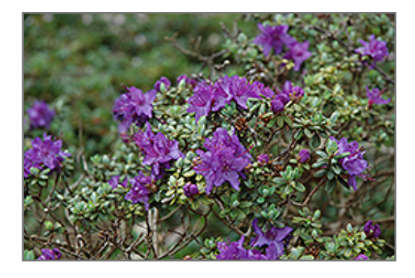
Dwarf Purple Rhododendron flowers

Dwarf Purple Rhododendron will grow to be about 24 inches tall at maturity, with a spread of 24 inches. It has a low canopy. It grows at a slow rate, and under ideal conditions can be expected to live for 40 years or more.