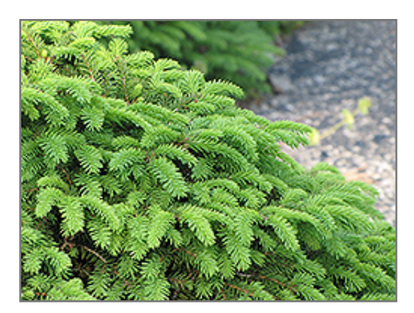
Birds Nest Spruce foliage

Birds Nest Spruce is a dense multi-stemmed evergreen shrub with a more or less rounded form. Its relatively fine texture sets it apart from other landscape plants with less refined foliage.