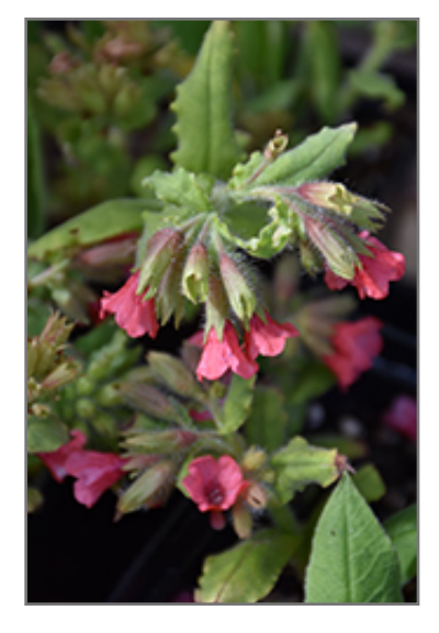
Redstart Lungwort flowers

This attractive variety has flowers in spring that emerge coral red from pink buds; foliage is a medium green with no silver spotting; perfect in the garden, massed along border fronts or in containers