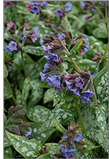
High Contrast Lungwort flowers

High Contrast Lungwort is recommended for the following landscape applications;