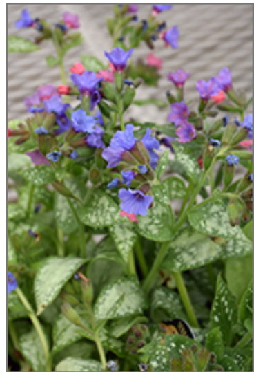
High Contrast Lungwort flowers