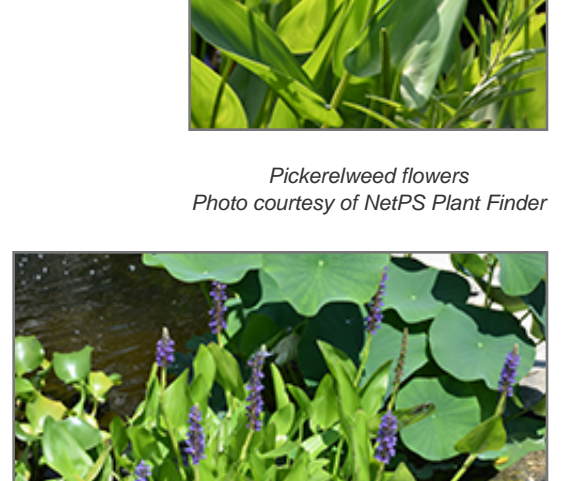
Pickerelweed in bloom

This plant will require occasional maintenance and upkeep, and is best cleaned up in early spring before it resumes active growth for the season. Gardeners should be aware of the following characteristic(s) that may warrant special consideration;