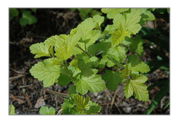
Common Ninebark foliage