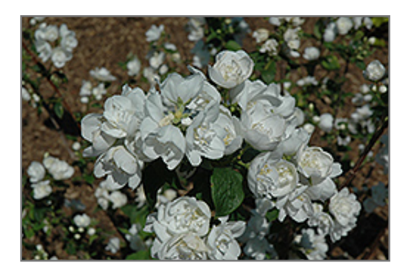
Snow White Sensation Mockorange flowers

A stunning flowering shrub covered in lovely citrus scented double white blooms in late spring; spectacular in flower, fades to the background the rest of the year, use in conjunction with other plants; very adaptable, good form for a mockorange