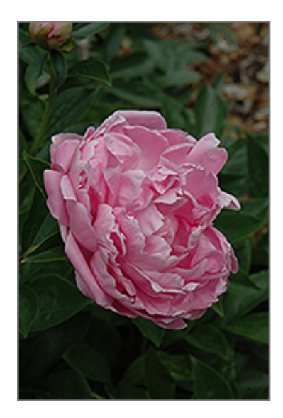
Pink Baroness Schroeder Peony flowers