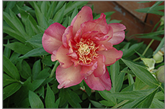
Kopper Kettle Peony flowers