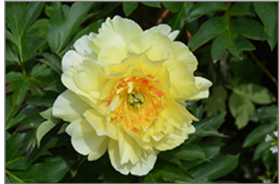
Bartzella Peony flowers