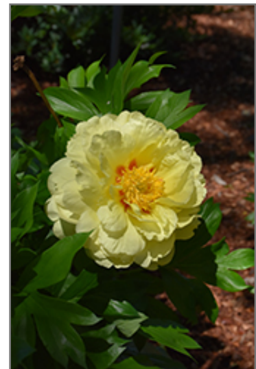
Bartzella Peony flowers