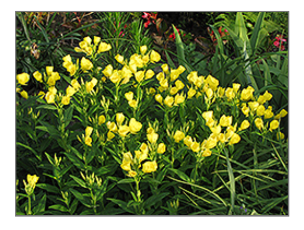
Sundrops in bloom