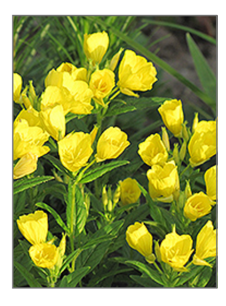
Sundrops flowers