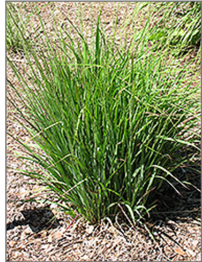
Moorhexe Purple Moor Grass