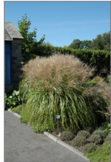
Huron Sunrise Maiden Grass

Huron Sunrise Maiden Grass is recommended for the following landscape applications;