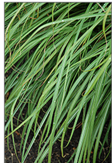
Huron Sunrise Maiden Grass foliage