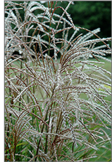
Huron Sunrise Maiden Grass flowers

This plant does best in full sun to partial shade. It prefers to grow in average to moist conditions, and shouldn't be allowed to dry out. It is not particular as to soil type or pH. It is highly tolerant of urban pollution and will even thrive in inner city environments. This is a selected variety of a species not originally from North America. It can be propagated by division; however, as a cultivated variety, be aware that it may be subject to certain restrictions or prohibitions on propagation.