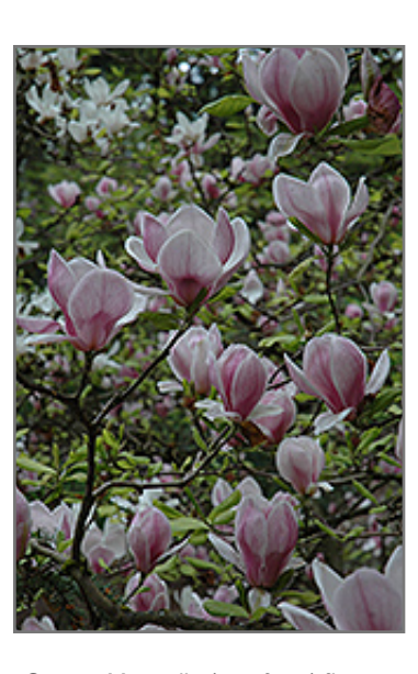
Saucer Magnolia (tree form) flowers

Saucer Magnolia (tree form) is covered in stunning fragrant pink cup-shaped flowers with white overtones held atop the branches in early spring before the leaves. It has dark green deciduous foliage. The large pointy leaves turn coppery-bronze in fall.