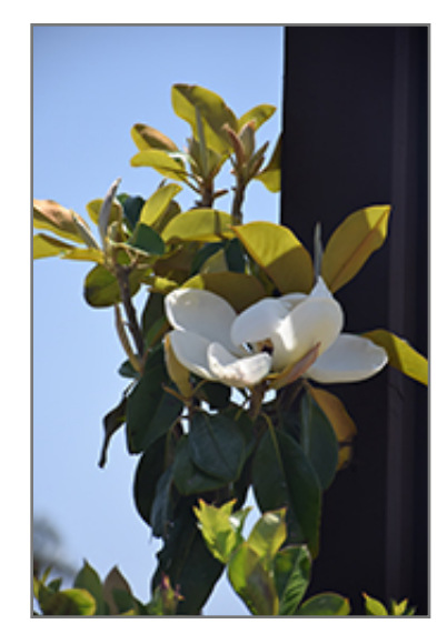
Saint Mary Magnolia flowers

This is a relatively low maintenance tree, and should only be pruned after flowering to avoid removing any of the current season's flowers. Deer don't particularly care for this plant and will usually leave it alone in favor of tastier treats. It has no significant negative characteristics.