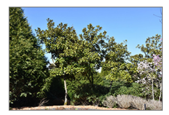
Saint Mary Magnolia