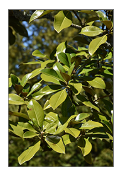
Saint Mary Magnolia foliage

This tree does best in full sun to partial shade. It requires an evenly moist well-drained soil for optimal growth, but will die in standing water. It is not particular as to soil type, but has a definite preference for acidic soils. It is somewhat tolerant of urban pollution, and will benefit from being planted in a relatively sheltered location. Consider applying a thick mulch around the root zone in winter to protect it in exposed locations or colder microclimates. This is a selection of a native North American species.