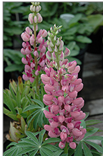
Gallery Pink Lupine flowers