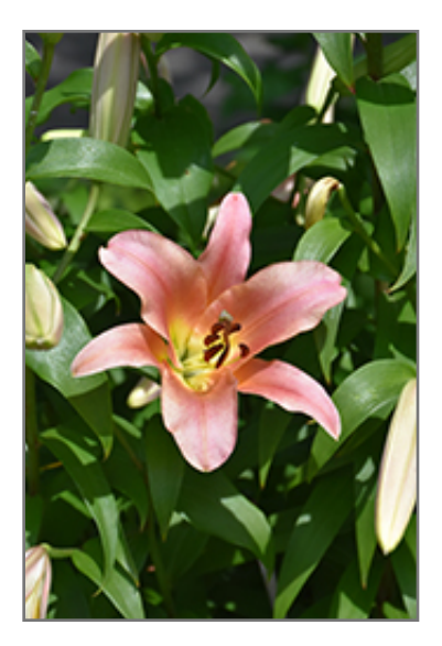
Gluhwein Lily flowers

A lovely tall oriental lily with blooms that are peach with a soft pink edge and tips; these beautiful flowers make a spectacular contrast in border plantings and are excellent in containers or along walkways