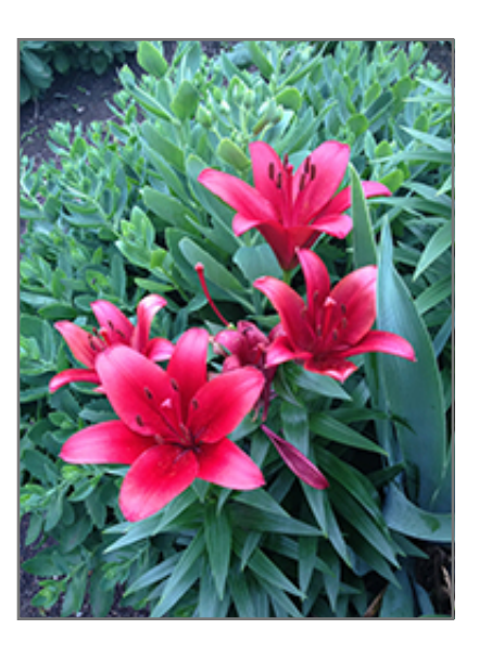
Cote D'Azur Lily in bloom

A lovely tall oriental lily with multiple blooms that are fuschia with light spotting; a single plant can produce up to a dozen blooms; spectacular when massed and great for cutting