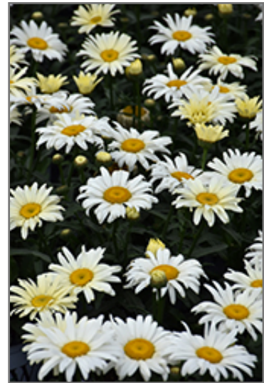
Amazing Daisies Banana Cream Shasta Daisy flowers

This plant will require occasional maintenance and upkeep, and should be cut back in late fall in preparation for winter. It is a good choice for attracting butterflies to your yard. Gardeners should be aware of the following characteristic(s) that may warrant special consideration;