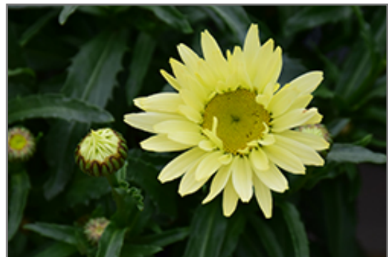
Amazing Daisies Banana Cream Shasta Daisy flowers