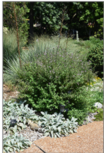
Leptodermis in bloom