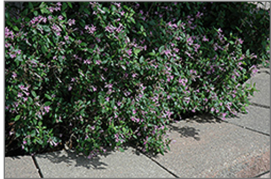
Leptodermis in bloom

This shrub does best in full sun to partial shade. It prefers to grow in average to moist conditions, and shouldn't be allowed to dry out. It is not particular as to soil type or pH. It is somewhat tolerant of urban pollution. This species is not originally from North America.