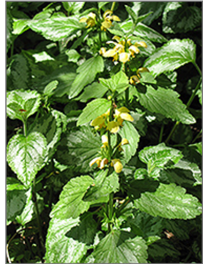
Yellow Archangel in bloom