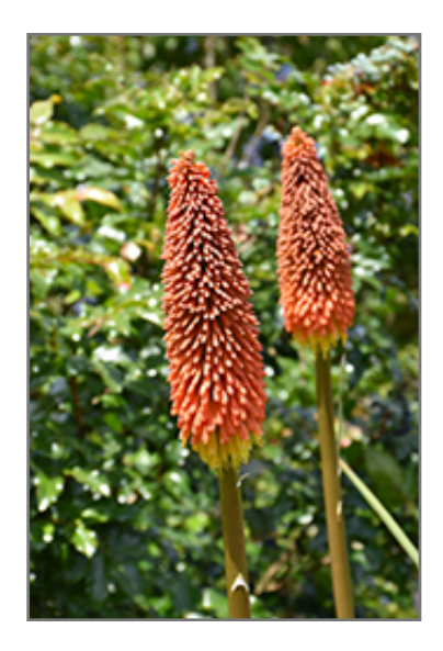
Shining Sceptre Torchlily flowers

Shining Sceptre Torchlily is recommended for the following landscape applications;