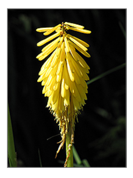
Shining Sceptre Torchlily flowers