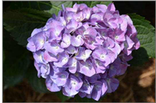
Cityline Berlin Hydrangea flowers