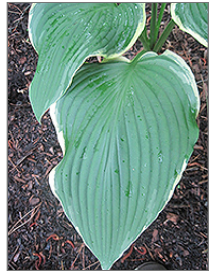
Yellow River Hosta foliage