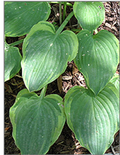
Wooly Bully Hosta foliage

A blue-green leaf center with chartreuse margins; a thin white line separates the leaf center and margin late in the season; spikes of pale lavender flowers in mid-summer; a stunning specimen in the garden or border