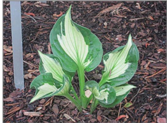
Whirlwind Hosta

This is a relatively low maintenance plant, and is best cleaned up in early spring before it resumes active growth for the season. Gardeners should be aware of the following characteristic(s) that may warrant special consideration;