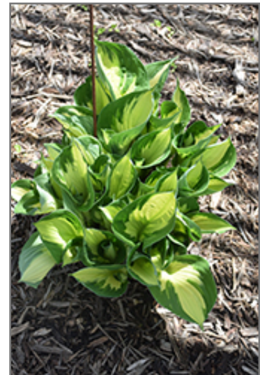
Whirlwind Hosta