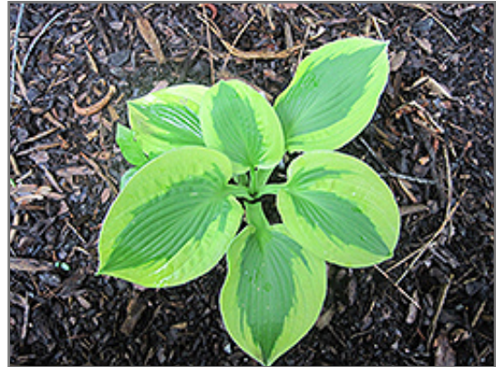
Tropical Storm Hosta