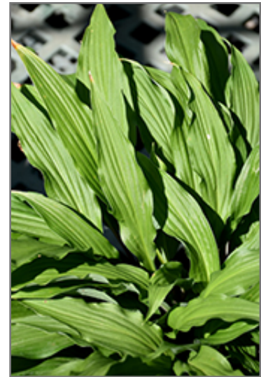
The Razor's Edge Hosta foliage