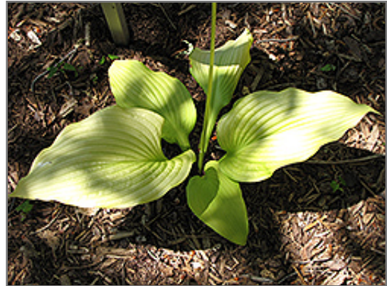
Templar Gold Hosta