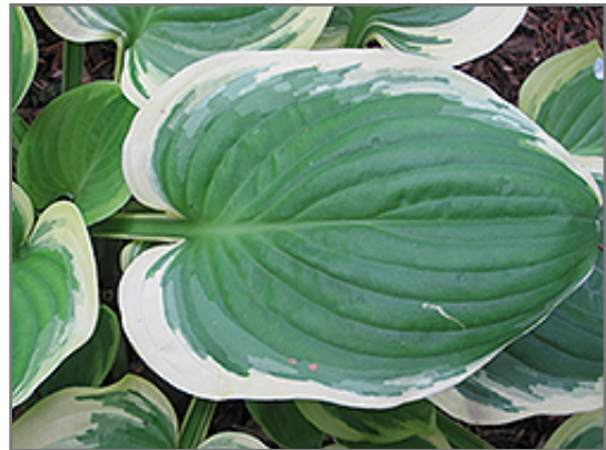
Sweet Innocence Hosta foliage

Sweet Innocence Hosta is recommended for the following landscape applications;