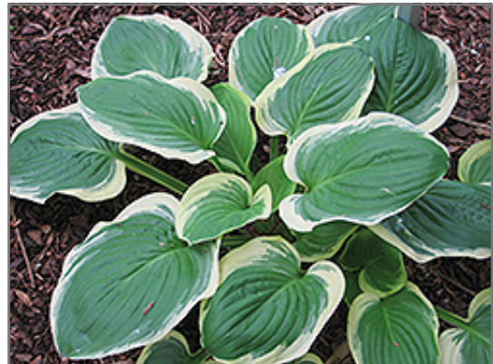
Sweet Innocence Hosta