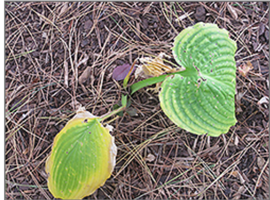
Surf and Turf Hosta foliage