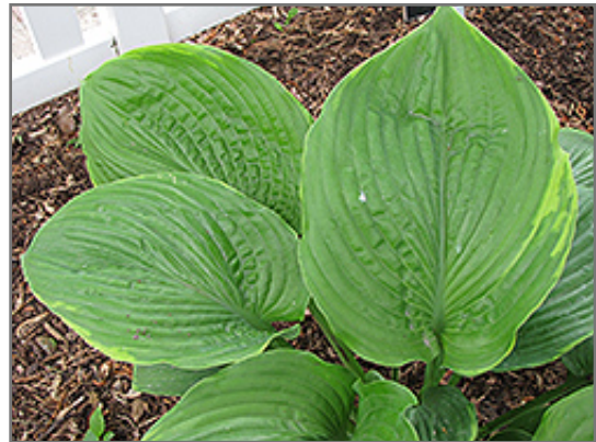
Sum It Up Hosta foliage