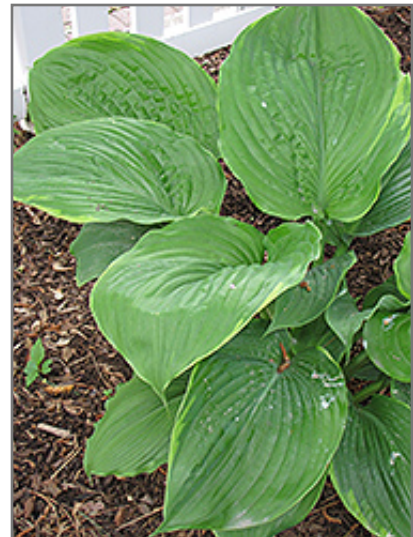
Sum It Up Hosta