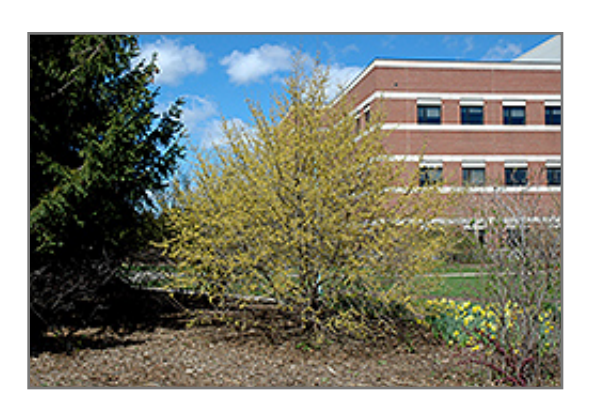
Cornelian Cherry Dogwood in bloom