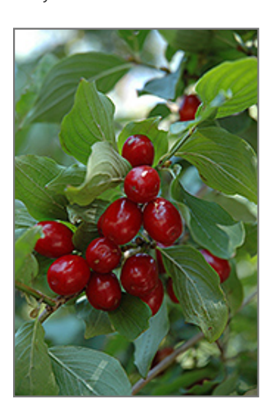
Cornelian Cherry Dogwood fruit