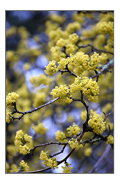
Cornelian Cherry Dogwood flowers

This tree does best in full sun to partial shade. It is very adaptable to both dry and moist locations, and should do just fine under average home landscape conditions. It is not particular as to soil type or pH. It is somewhat tolerant of urban pollution. Consider applying a thick mulch around the root zone in winter to protect it in exposed locations or colder microclimates. This species is not originally from North America.