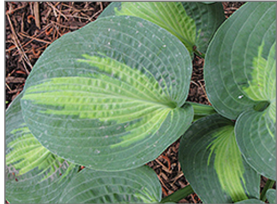
St. Paul Hosta foliage

St. Paul Hosta is recommended for the following landscape applications;