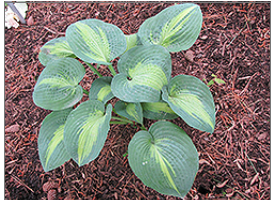
St. Paul Hosta