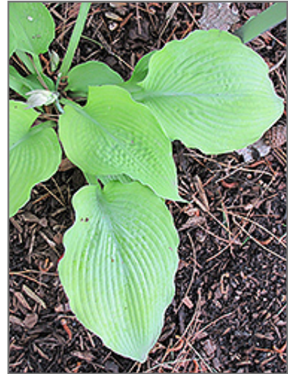
Solar Flare Hosta foliage