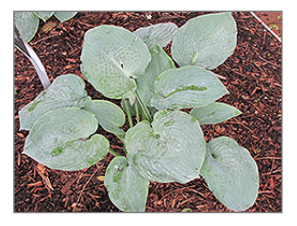
Silver Bay Hosta