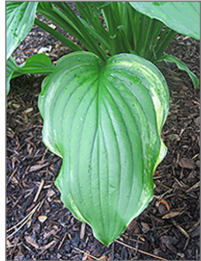
Savannah Supreme Hosta foliage