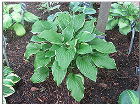
Savannah Supreme Hosta