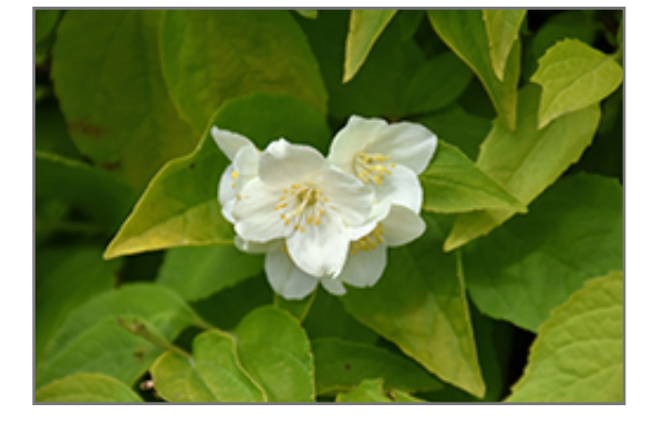
Golden Mockorange flowers

Golden Mockorange is a dense multi-stemmed deciduous shrub with an upright spreading habit of growth. Its average texture blends into the landscape, but can be balanced by one or two finer or coarser trees or shrubs for an effective composition.