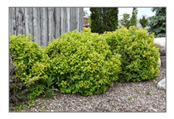
Golden Mockorange

This is a relatively low maintenance shrub, and should only be pruned after flowering to avoid removing any of the current season's flowers. It has no significant negative characteristics.