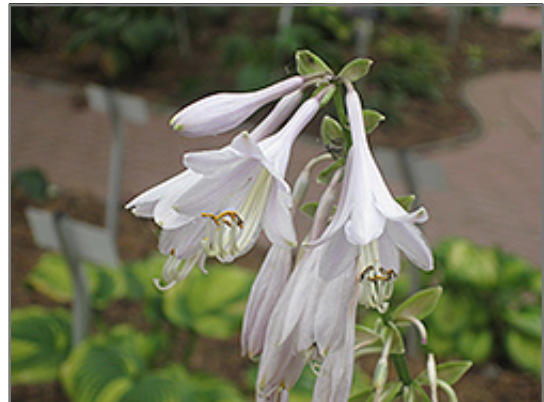
Satisfaction Hosta flowers