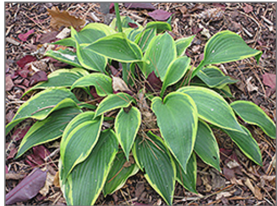
Satisfaction Hosta