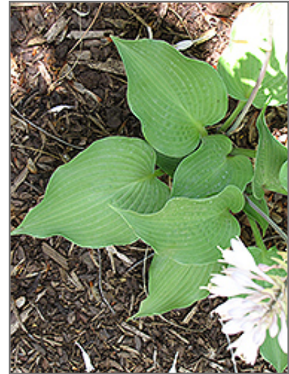
Reptilian Hosta foliage